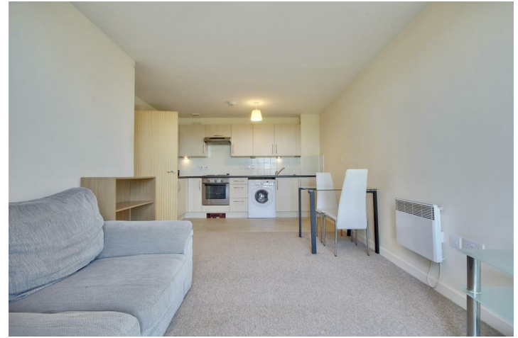
APARTMENT FLOOR 483 sq.ft. (44.8 sq.m.) approx.